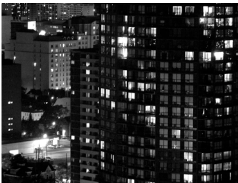
Hamilton in Black Alida van Halderen