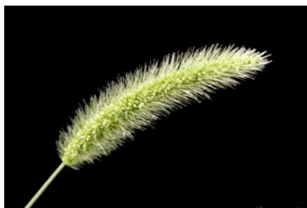
Ornamental Grass, Gool Tamboli