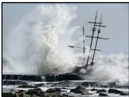
Power, Juraj Dolanjski