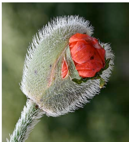
Poppy Bud, Pesi Tamboli